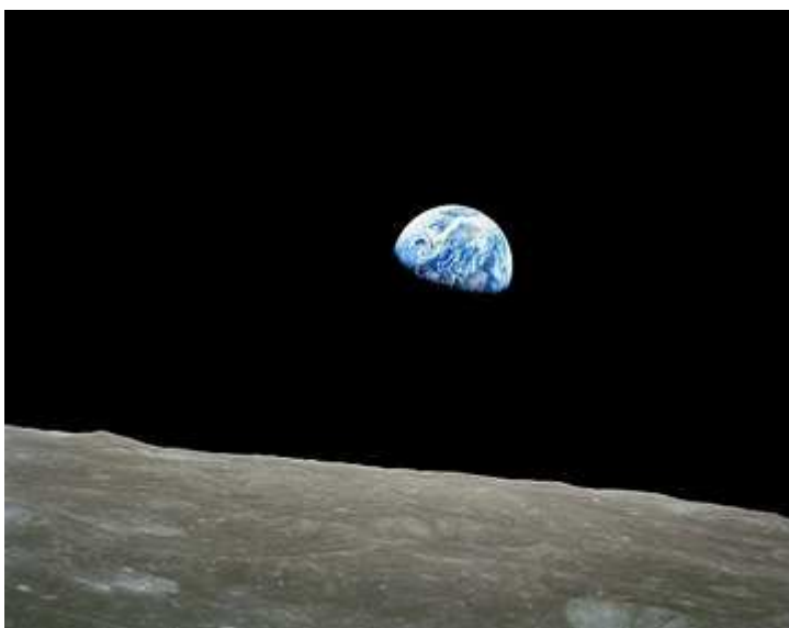
Earthrise - from Apollo 8, “And God made the firmament” Genesis 1:7

“Ye are brought unto fountains of living water which ye digged not; do not cast earth into them with the Philistines [Genesis 26:15], neither prefer broken pits before them with the wicked Jews [Jeremiah 2:13]. Others have laboured, and you may enter into their labours; O receive not so great things in vain, O despise not so great salvation!...a blessed thing it is, and will bring us to everlasting blessedness in the end, when God speaketh unto us, to hearken; when he setteth his word before us, to read it; when he stretcheth out his hand and calleth, to answer, Here am I, here we are to do thy will, O God. The Lord work a care and conscience in us to know him and serve him, that we may be acknowledged of him at the appearing of our Lord Jesus Christ, to whom with the holy Ghost, be all praise and thanksgiving. Amen.”